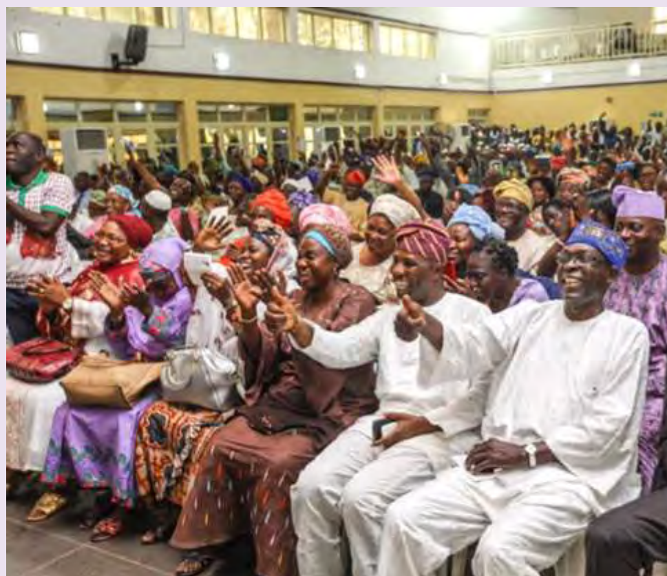
Lagos civil servants at a function

He, therefore, urged the participating officers to develop themselves personally after the course, as it is a stepping stone to learn more about IT, adding that it is also expedient of them to utilise the knowledge acquired during the course by serving humanity diligently in their various offices.