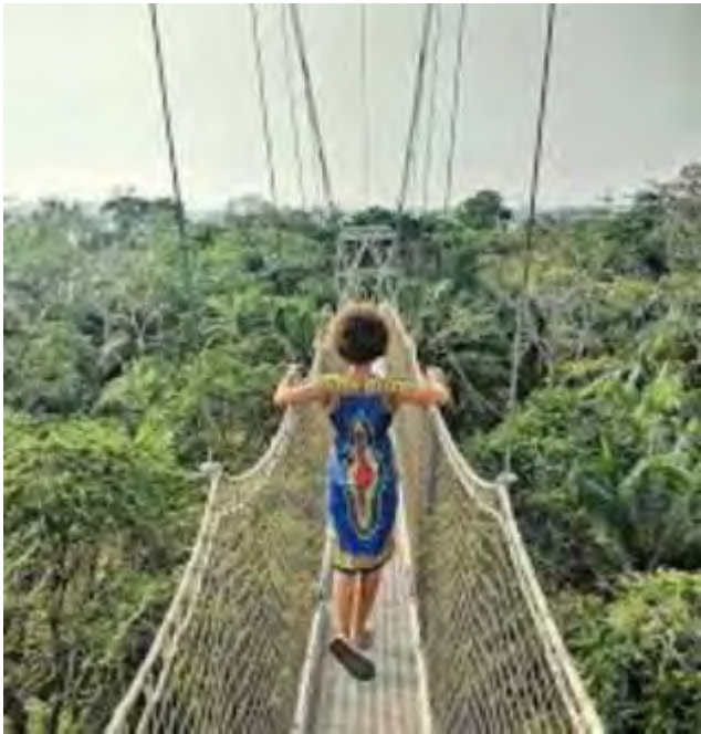
A tourist place in Lagos

direction for would-be investors willing to invest in the tourism value chain, like beaches, entertainment and transportation among others. "We are thinking of ways Lagos State can benefit economically from Tourism because for the rest of the world, Tourism is one of the highest earners worldwide and there are some countries that totally depend on tourism as their major source of income", she added.