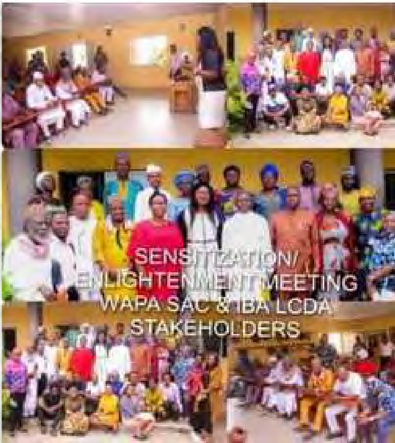
Cross section photograph of participants at the meeting

discussed the factors hindering the youths from accessing the facility, while proffering solutions to the challenges. The representatives of WAPA commended the State Government for the skill acquisition initiative as they urged the government to