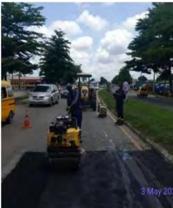
Road rehabilitation in Igando Ikotun