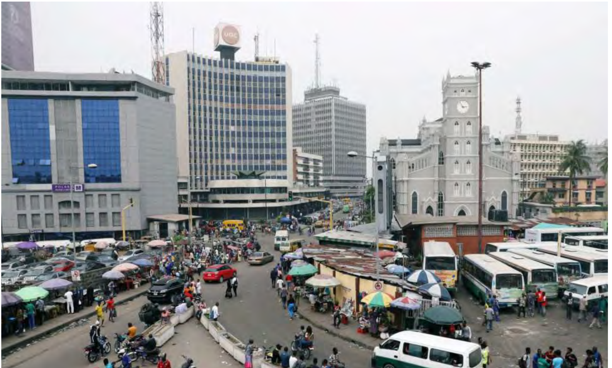
Lagos Urban Centre