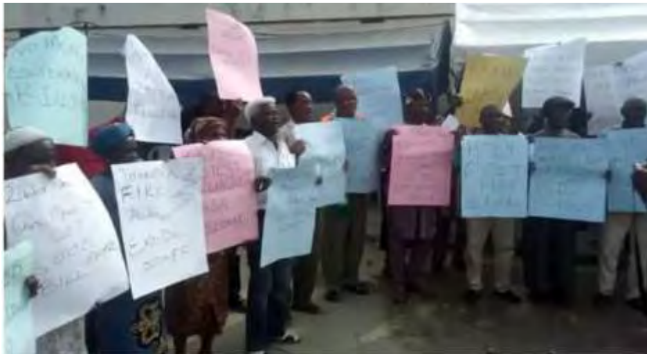
Protest against darkness in festac town

T he residents of FESTAC town in Amuwo-Odofin LG have marched down to Nigeria Power Holding Company (NPHC) in protest over electricity failure in some parts of the community.