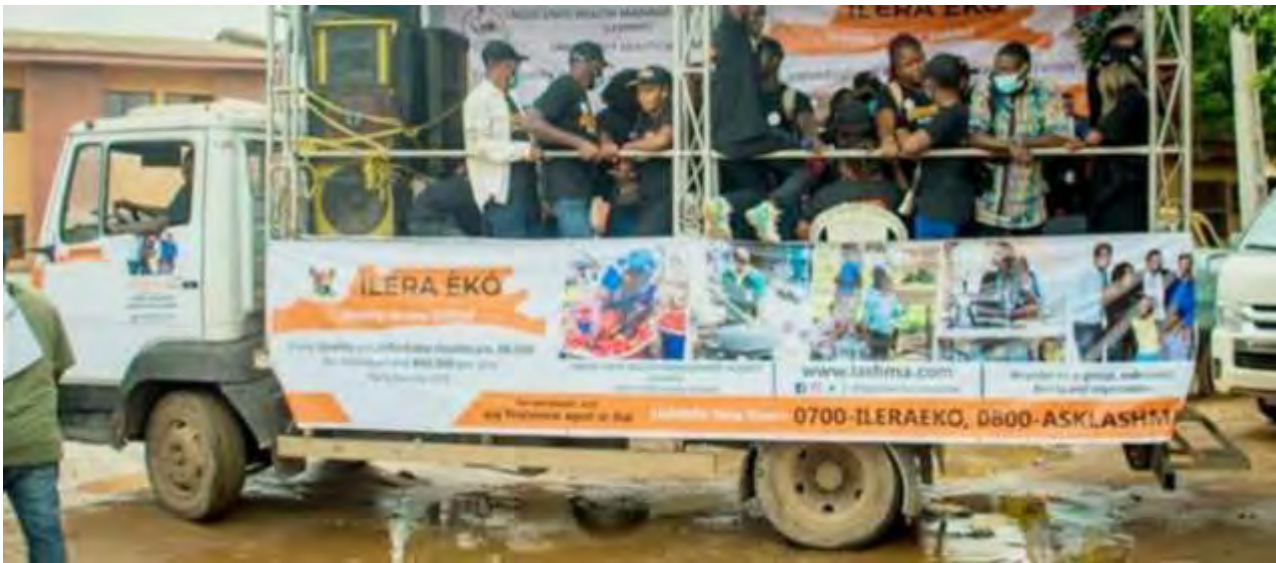
Road show on Ilera Eko