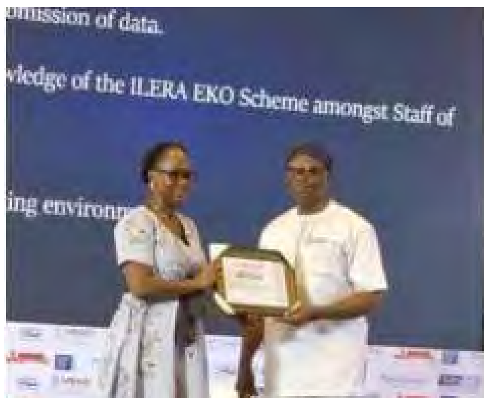
Orile-Agege chairman receiving PHC award