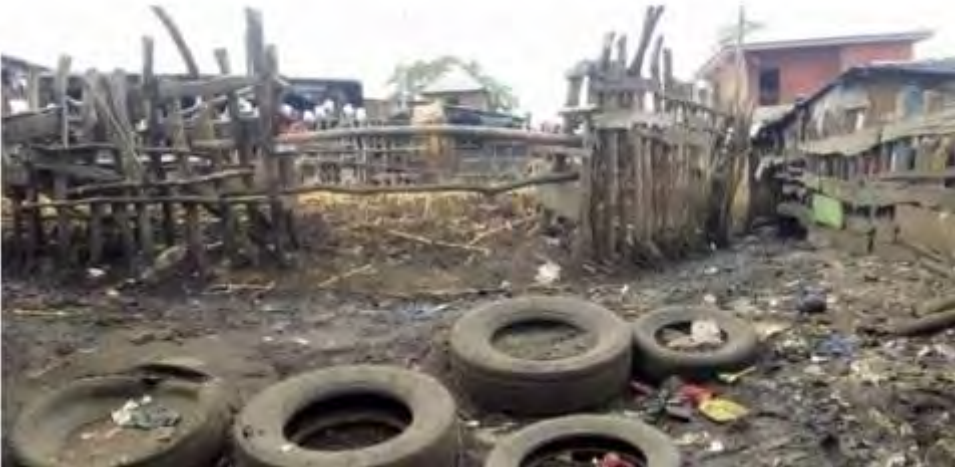
Alaba Rago Market

The authority of Iba LCDA has warned the traders at Alaba Rago