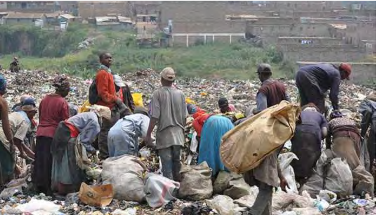
Scavenging at Lagos dumpsite

significant improvement in waste management, resulting in a cleaner and healthier environment for all.