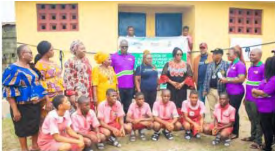
Festac Junior Grammar school students ,teachers with rotary club members

A Junior Grammar School in Amuwo-Odofin has got multimillion-naira donations from the Rotary Club FESTAC Central and the Rotary Club of Greenfield.