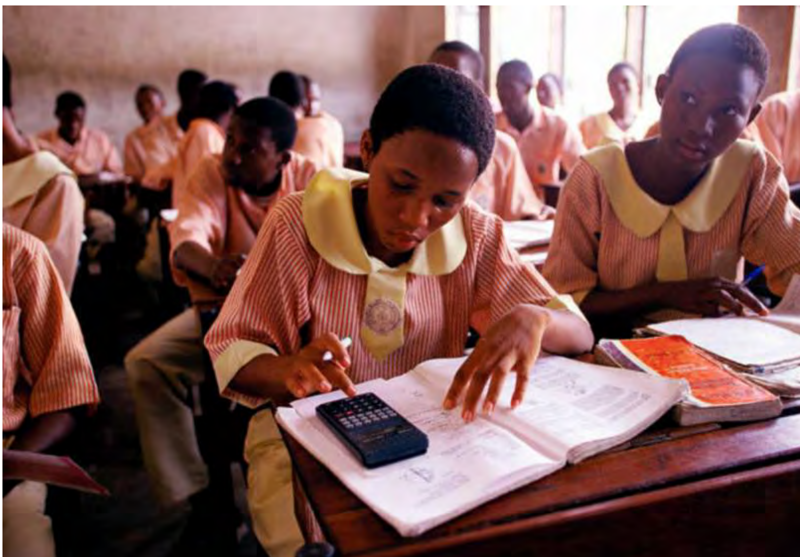
Pupils using scientific calculator