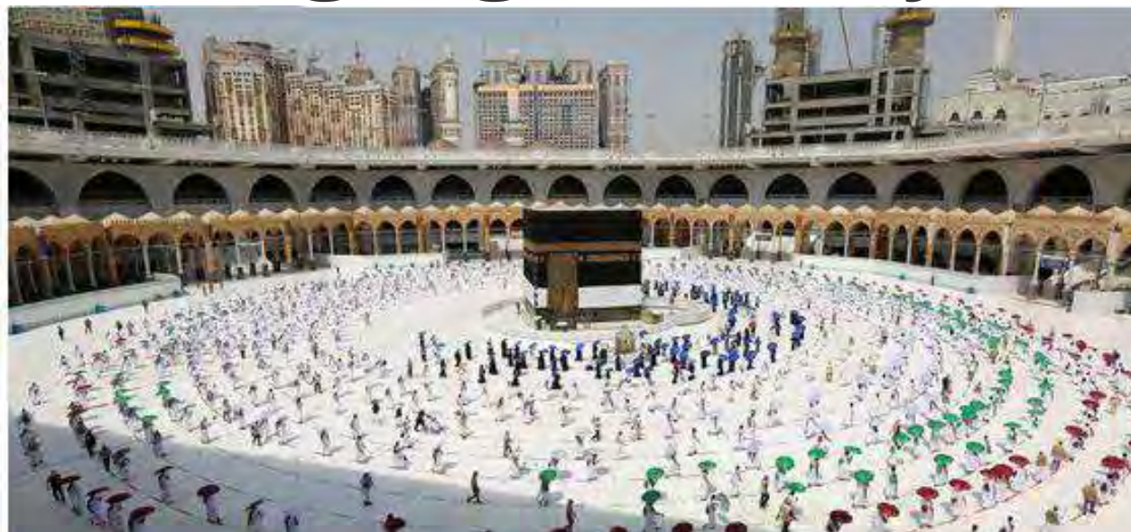
A view of the holy Kaaba

He said intending pilgrims from Agege, Amuwo-Odofin, and